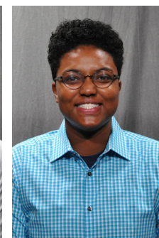
Assistant Coach 1st Season Youngstown St. '08