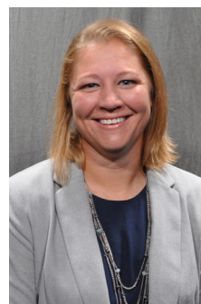
Associate Head Coach 2nd Season Green Mountain '99