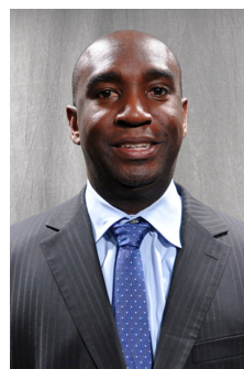
Head Coach 2nd Season Cal Poly State '90